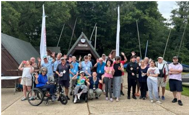
Shooting Stars Visitors