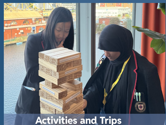
Activities and Trips