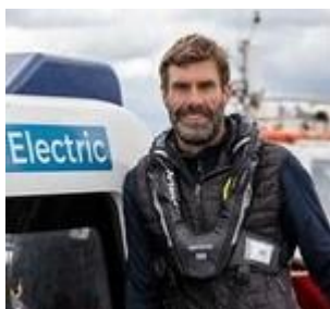
Dr Iain Percy