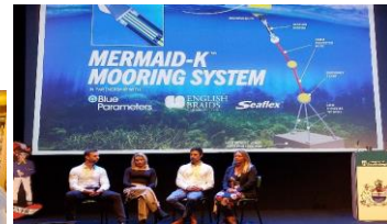
Representatives from four joint venture companies addressing sustainability within the marine industry