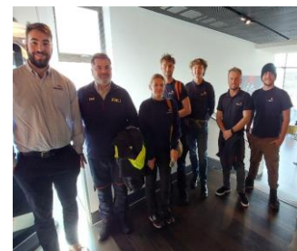
RNLi apprentices and leaders