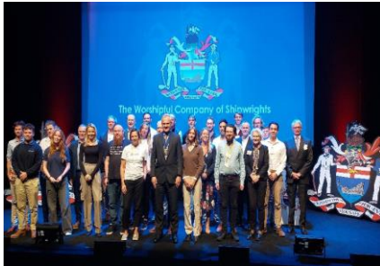
Lectures Speakers and Team