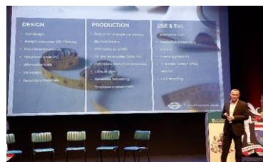
Sean Dempsey leading Sunseeker International's lifecycle sustainability project.