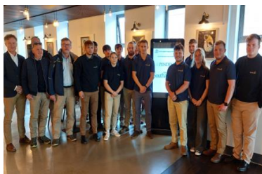
Pendennis apprentices and leaders