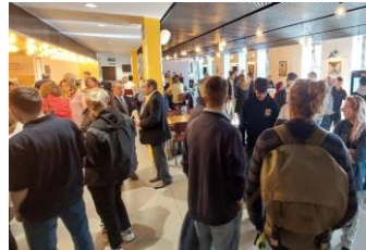
Networking with free refreshments