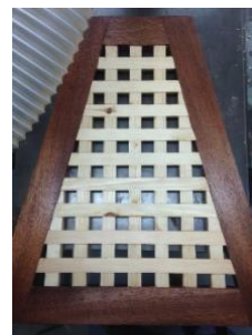
Assessment Project: 'Bessie', Truro River Yacht Grating