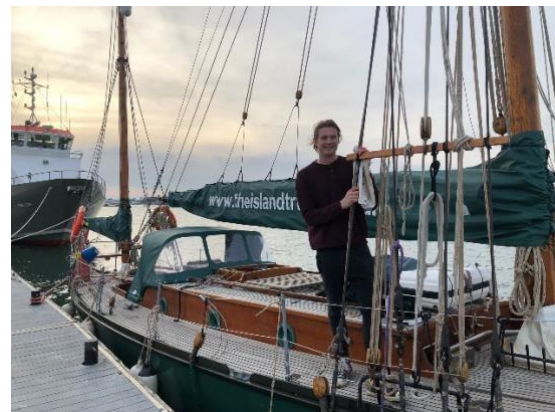
Me on Moosk, as Skipper for The Island Trust