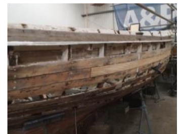
Oyster boat Project

These skills, combined with my improved knowledge, have immensely helped to prepare for my return to work with The Island Trust. Understanding how boats are made, and also how to restore and repair them, has proved invaluable for my work. It has greatly improved my confidence and allowed me to face my new challenging role as Skipper with a belief that I can manage it, and I am really enjoying this progression in my career.