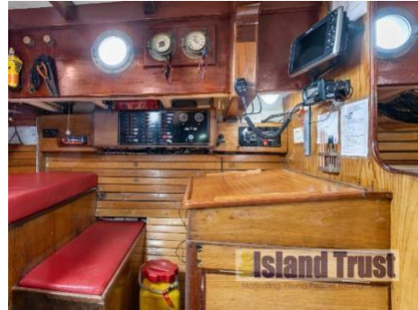
Sole board I made for Moosk – an Island A chart table I made for Moosk Trust Boat