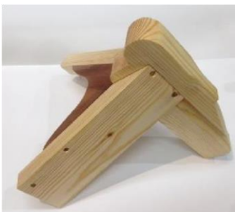
Assessment Project: Stem & Breasthook

Here are some examples of some of the work I completed whilst taking my diploma: