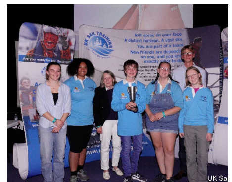
Pictured: Crew of Discovery Sailing Project's Alexander Fairey receiving the Bloodhound Trophy for Youngest Crew.