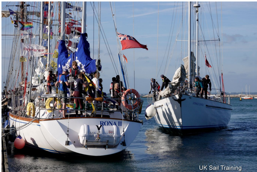
UK Sail Training

The conditions were ideal, with clear skies, a great sailing breeze and calm seas making for a confidence-building day on the water.