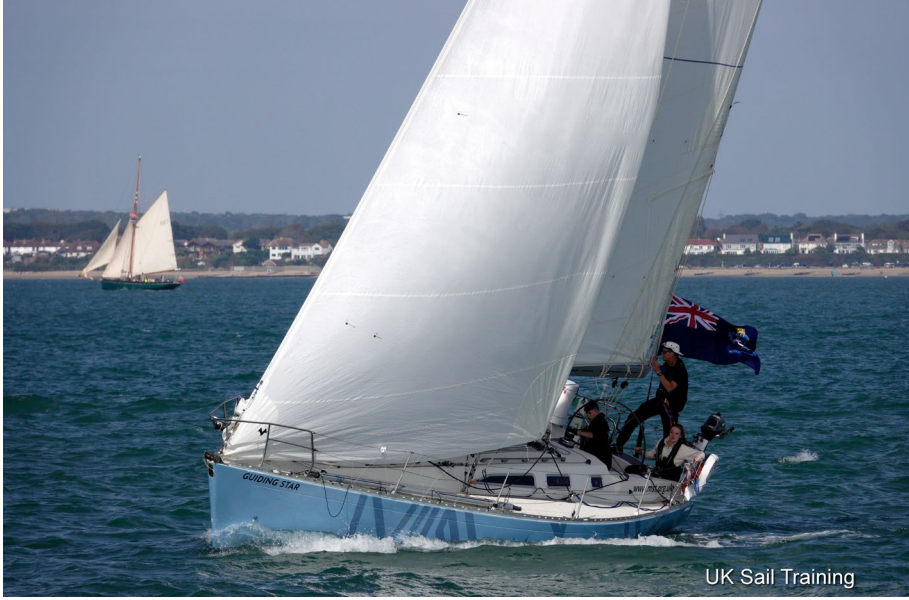
UK Sail Training

Pictured: Morning Star Trust's Guiding Star enjoying great sailing conditions with Island Trust's Pegasus