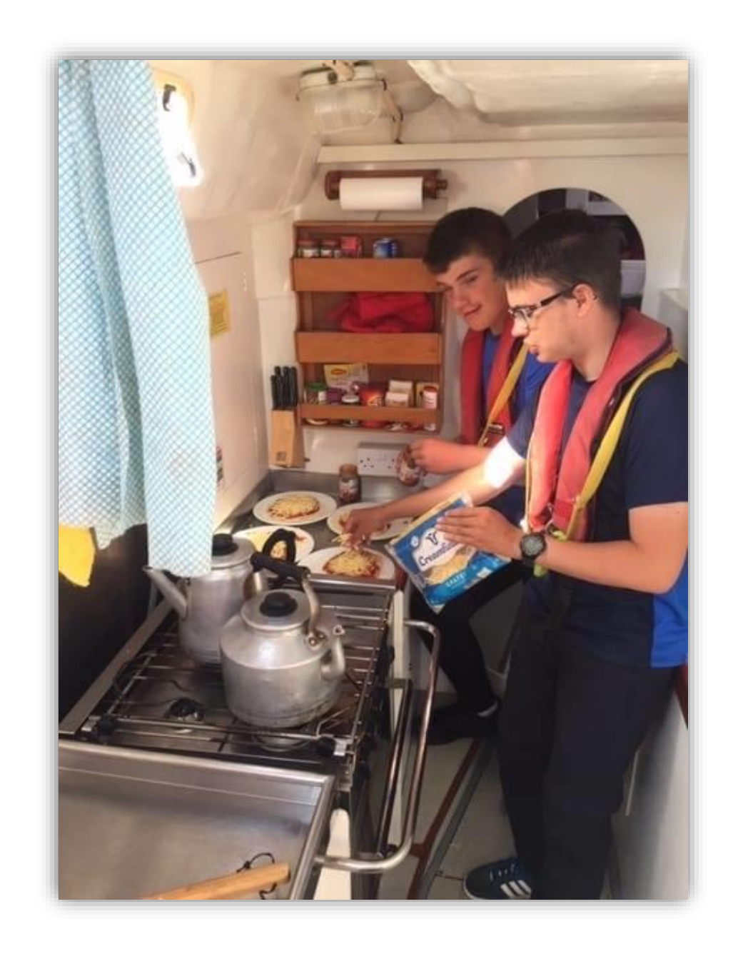
We feed ourselves