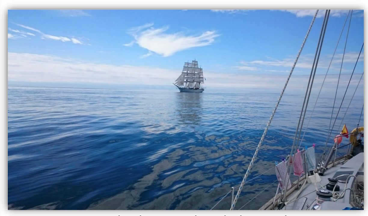
We take the smooth with the rough