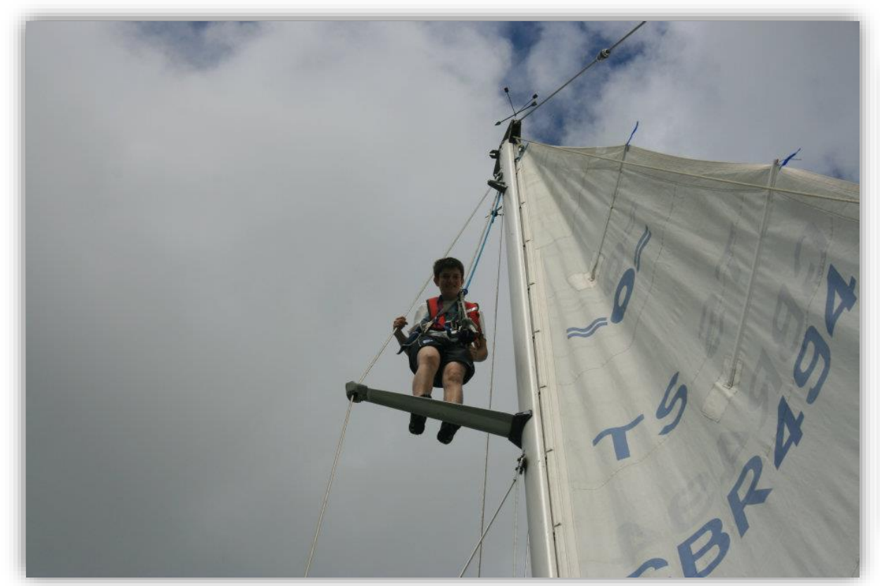
We smile up the mast