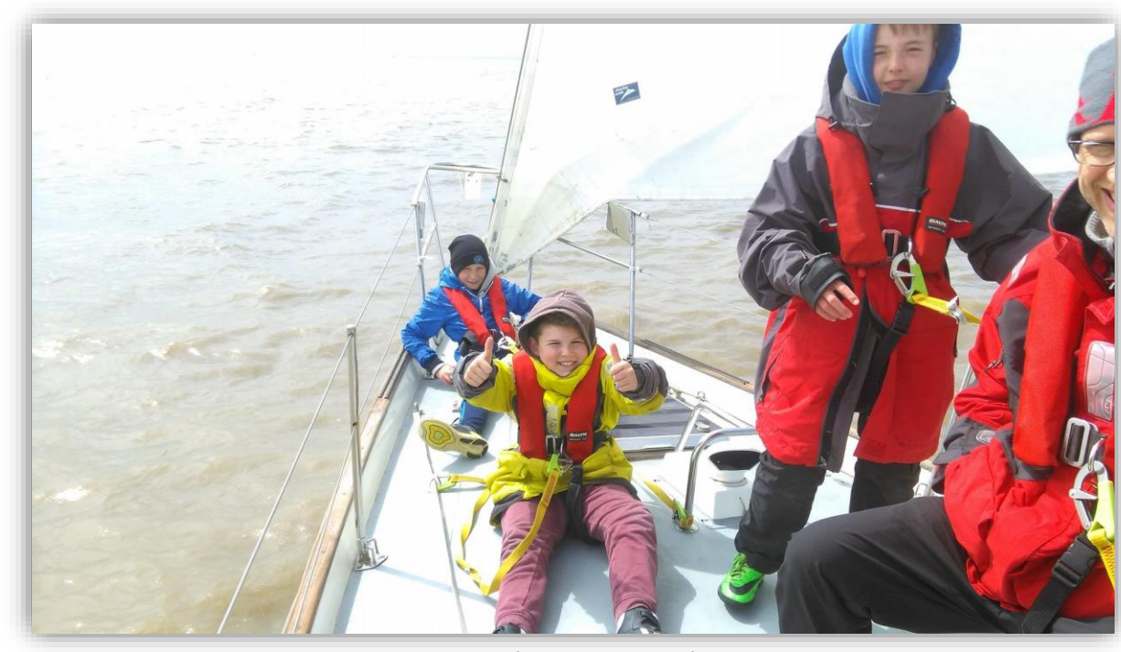
We smile sitting down