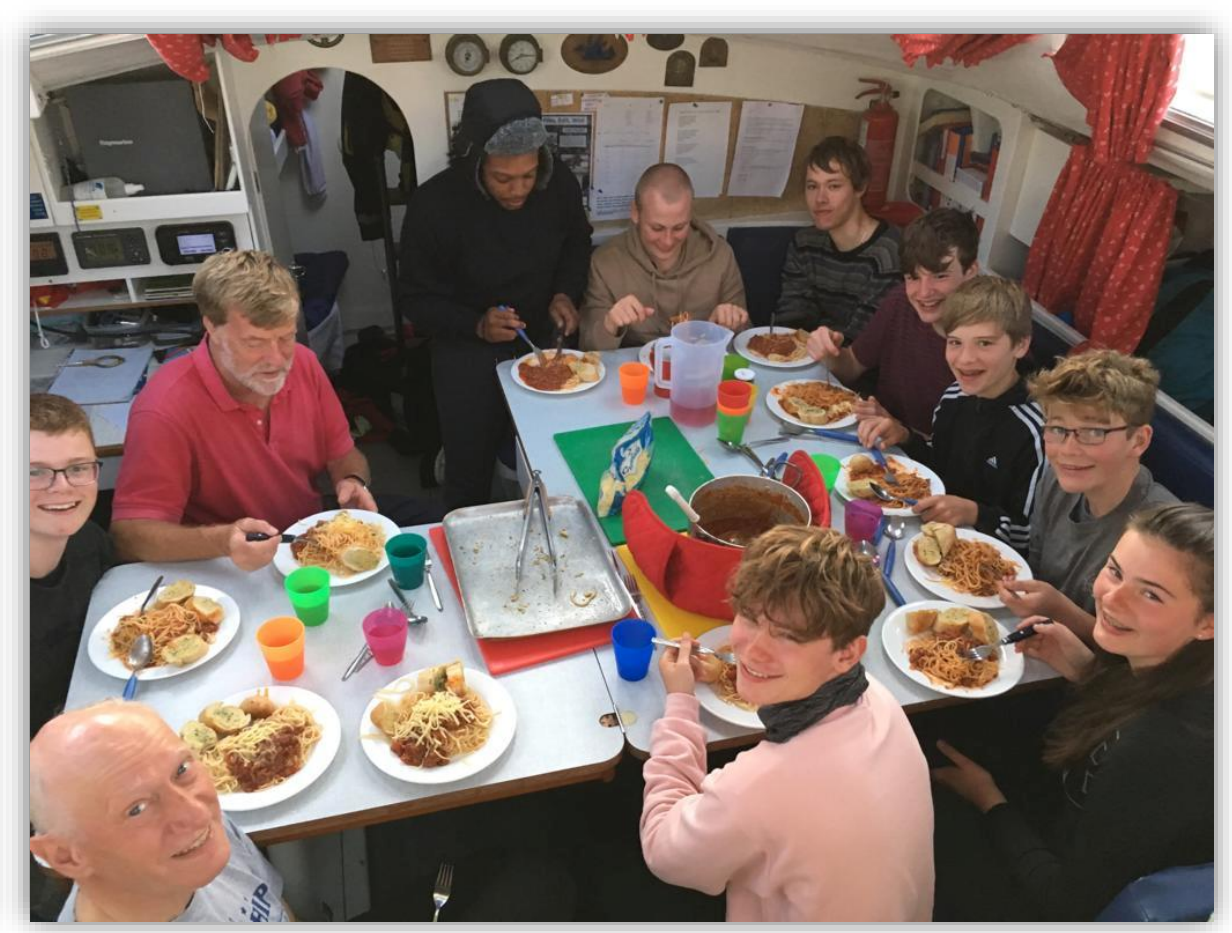
A well fed crew is a happy crew