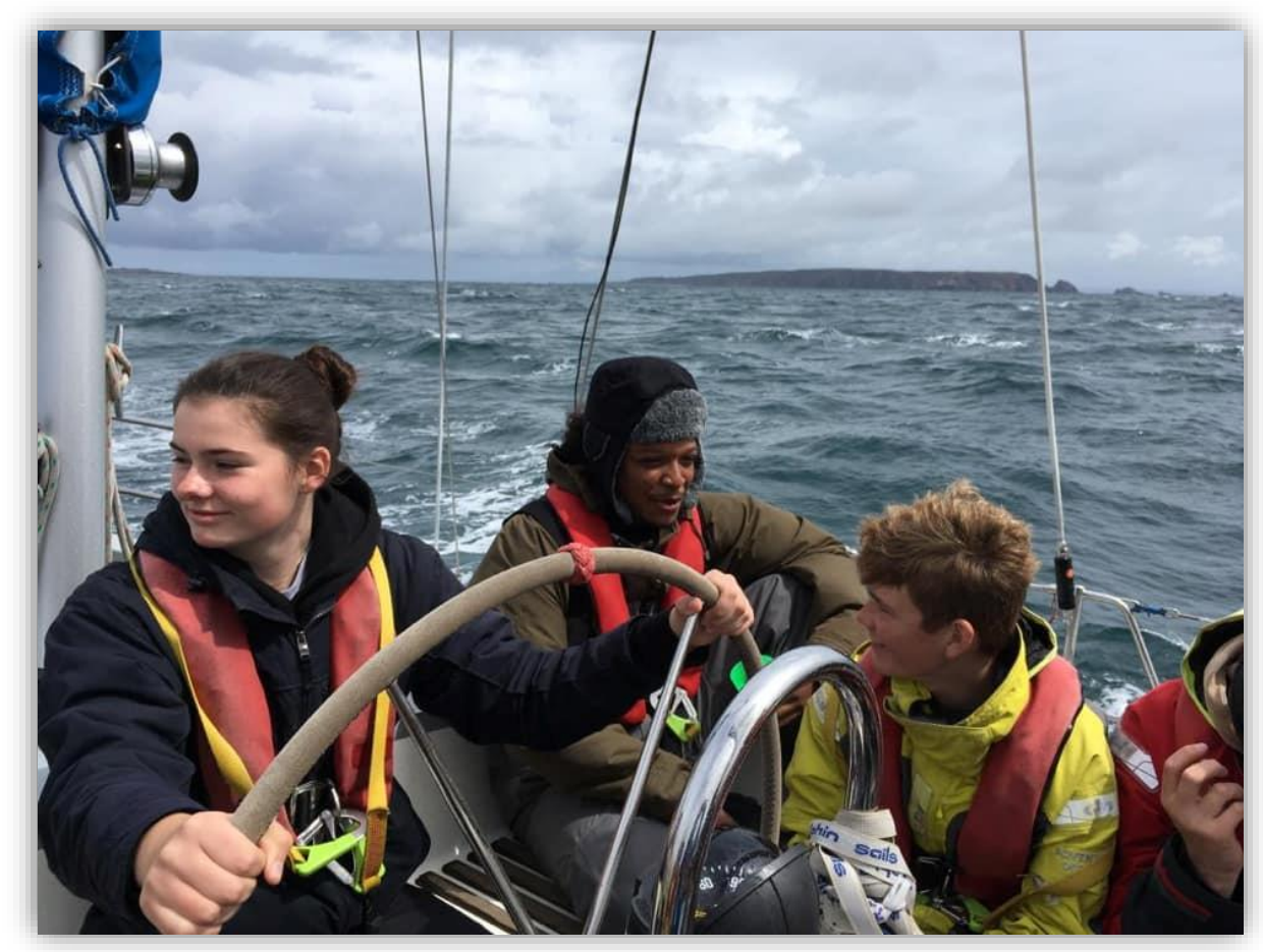
We take the rough with the smooth