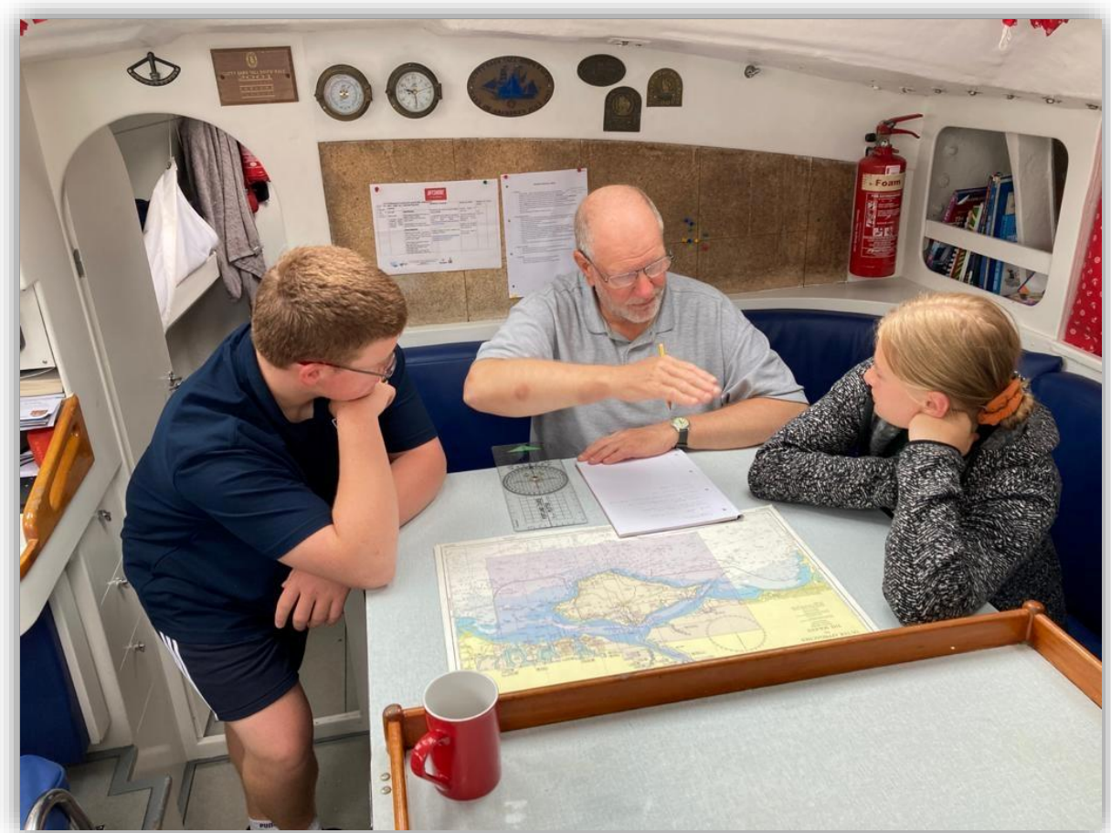
We Concentrate We Navigate