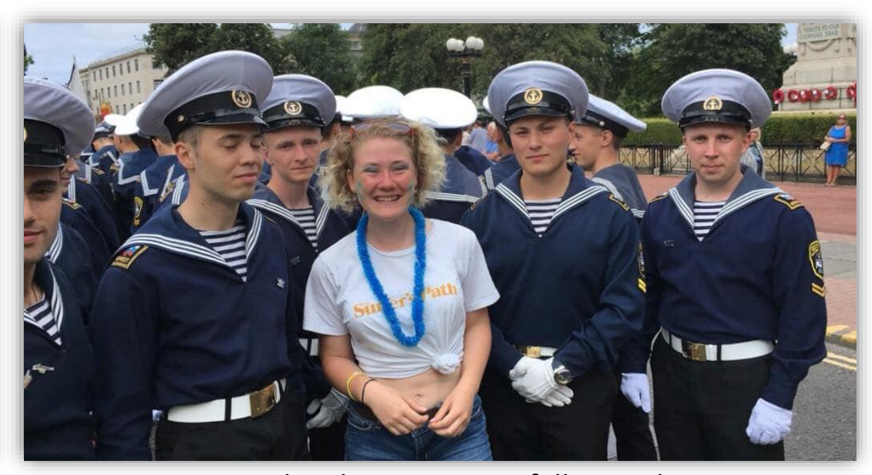
We smile when we meet fellow sailors