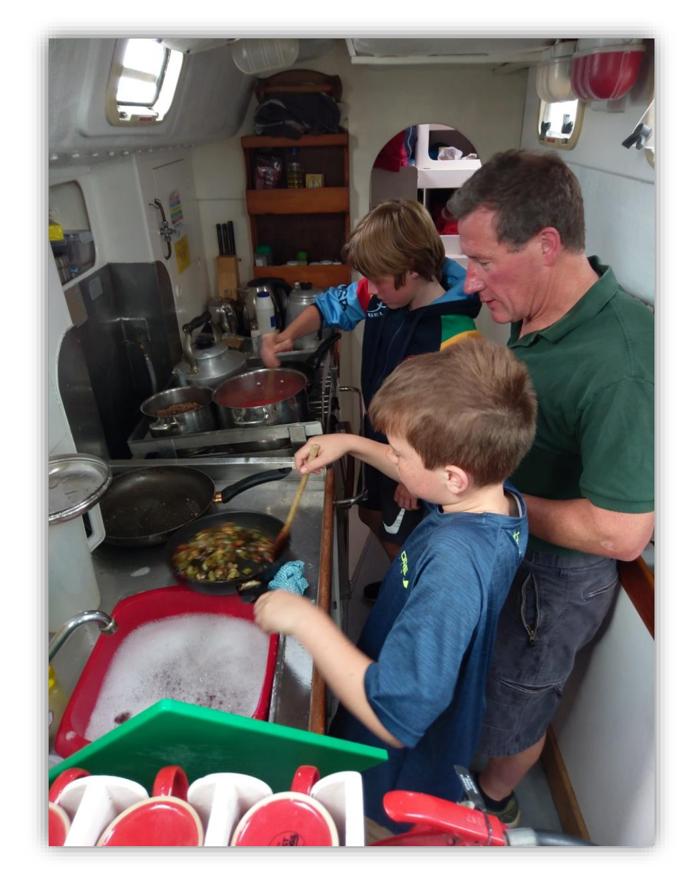
We feed ourselves