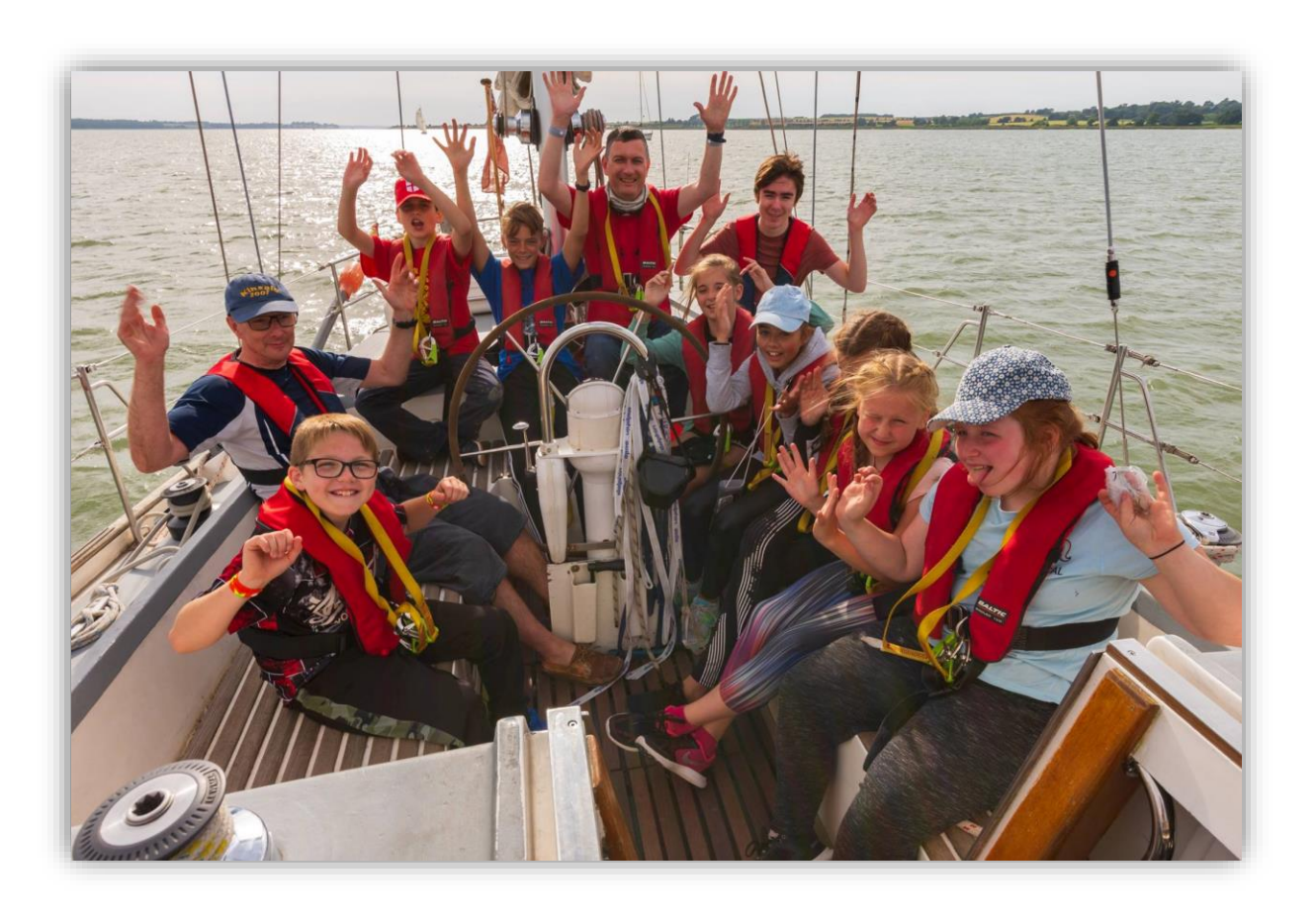
We are always smiling

During the last season, we asked each of our participants what our trips meant to them, and this is what they said: