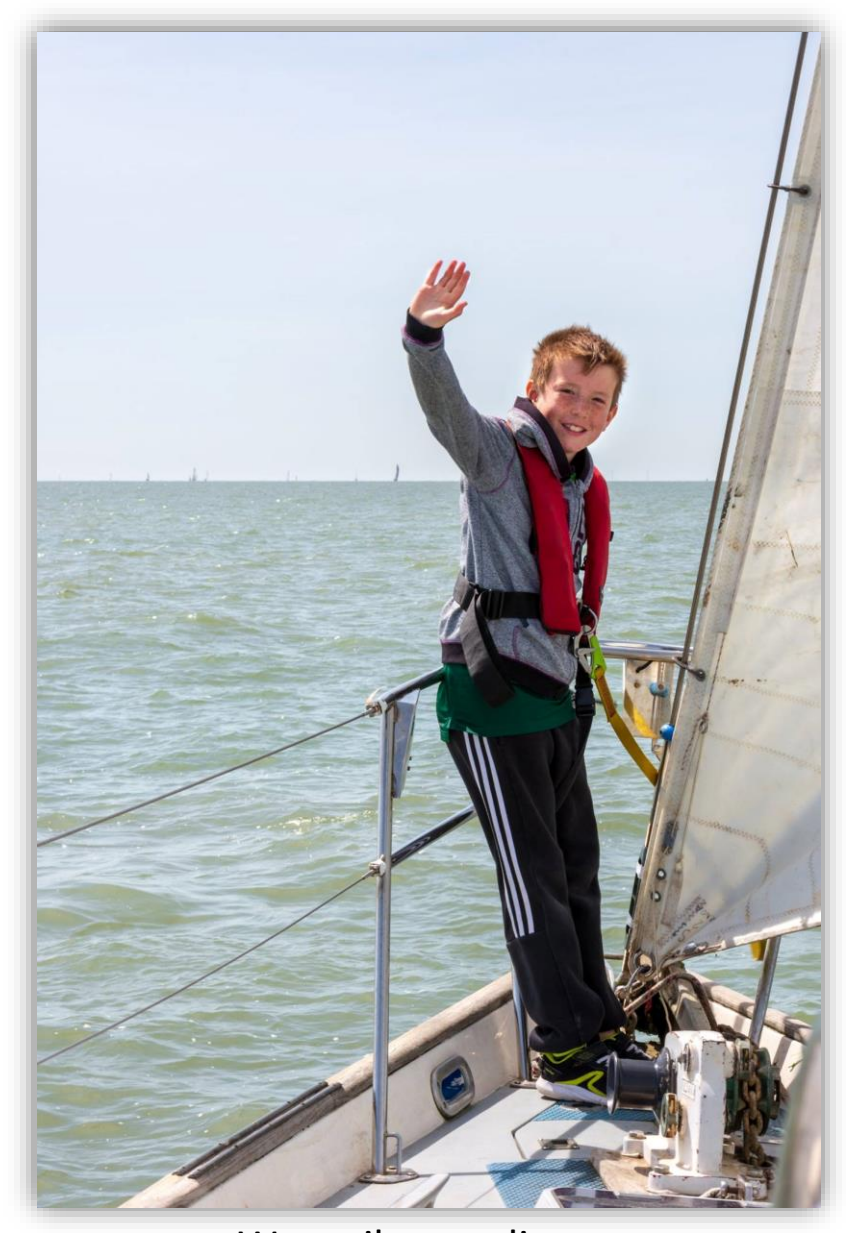
We smile standing up