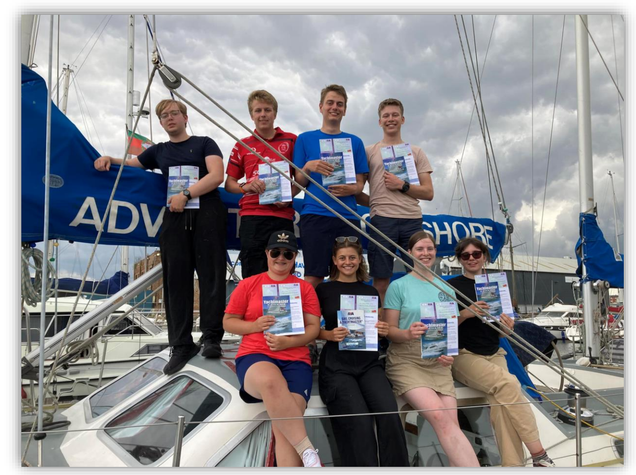
We smile when we complete our courses