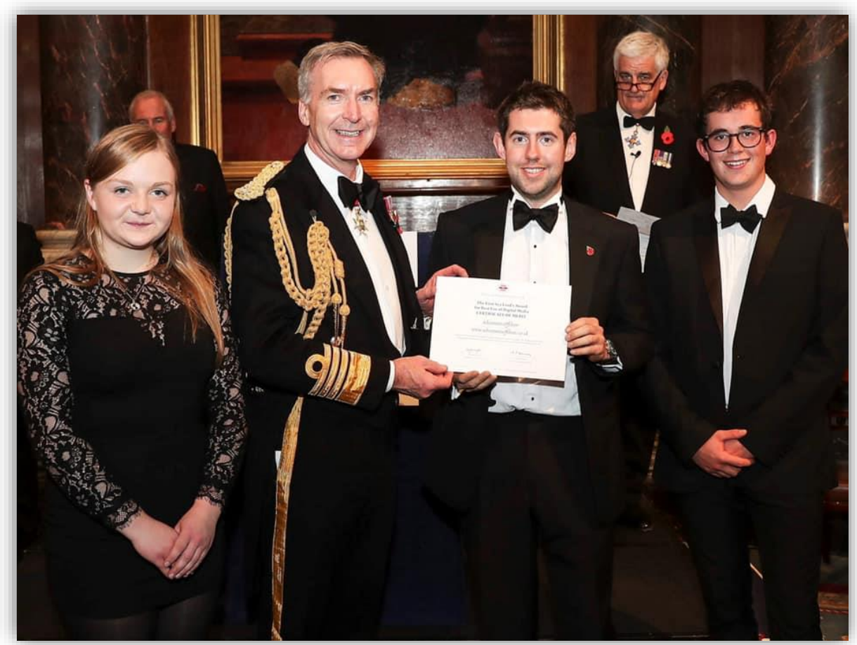
We smile when we are presented with awards