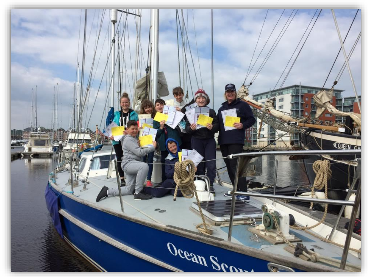
We smile when we are Certified at the end of a voyage