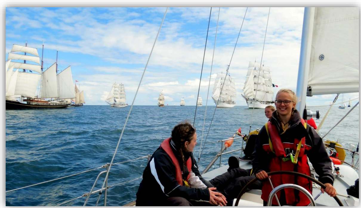
We smile when we are racing tall ships