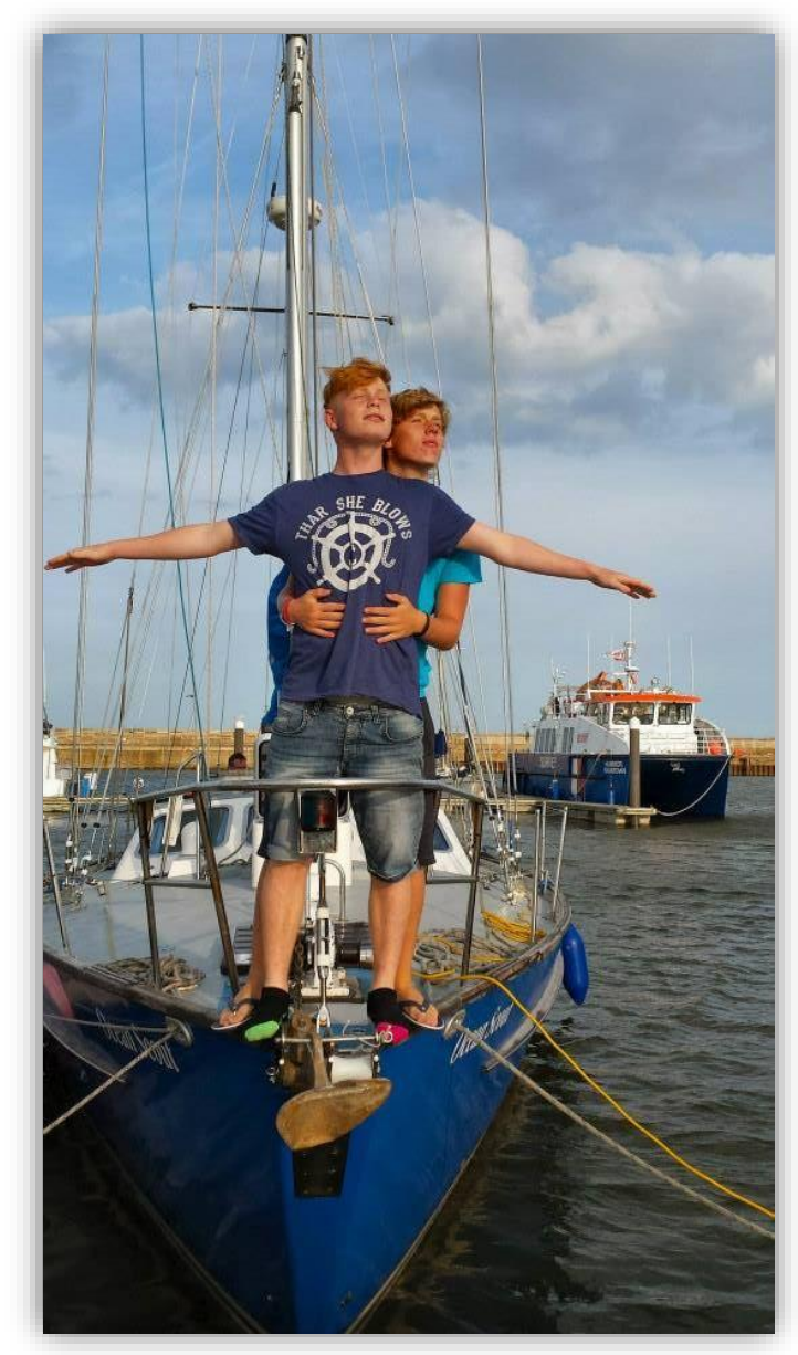
We smile at our own fellow sailors