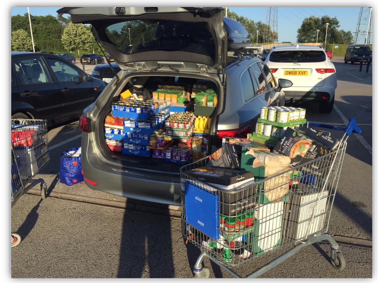
It's to do with the food - we do need a lot though