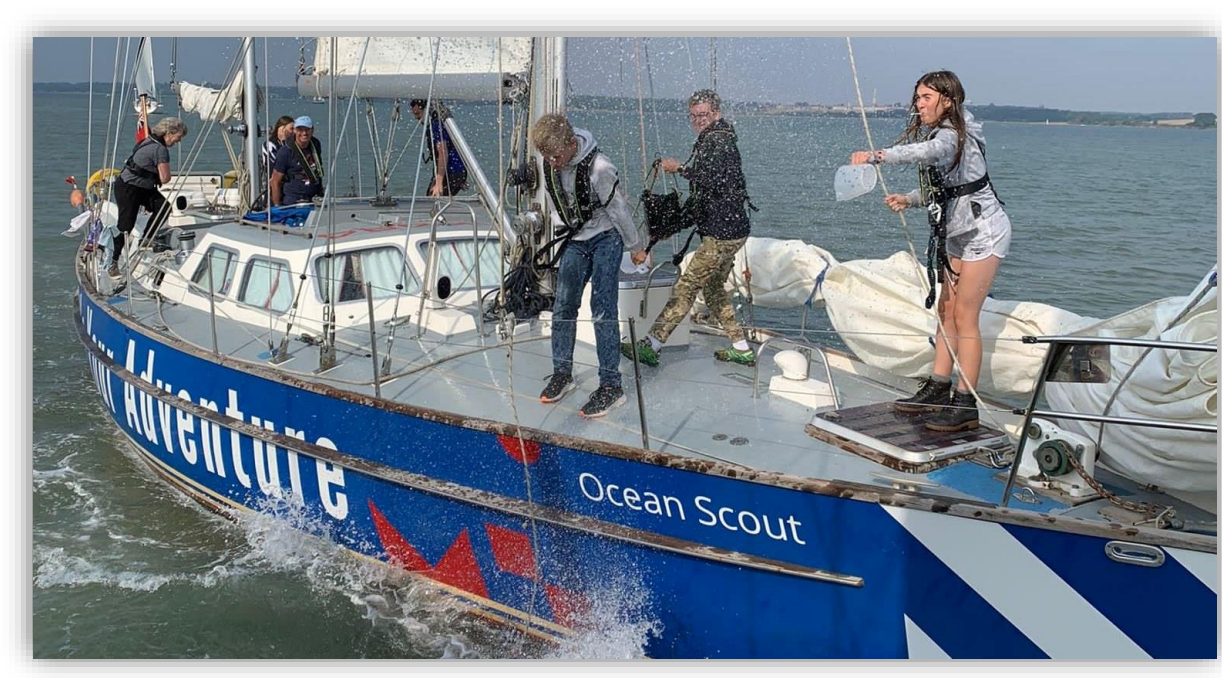
We smile when we have a water battle with our sister ship