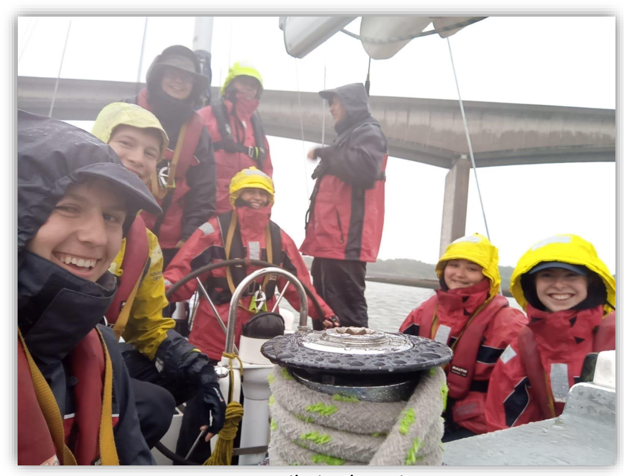
We smile in the rain