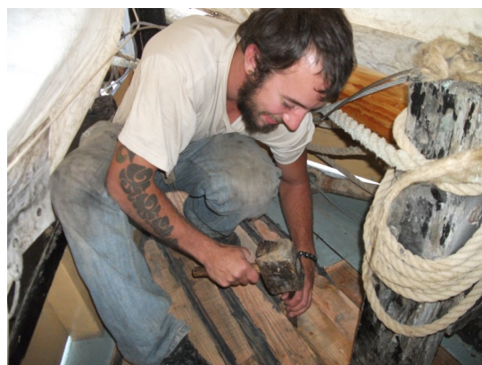
Traditional boatbuilding skills

their training at one of the schools teaching modern (e.g.GRP) and traditional timber ship and boat building. Five Bursaries were awarded in 2012/13 to students at Strathclyde, Southampton and Newcastle Universities studying marine engineering and naval architecture and to the UK Sailing Academy for a student to gain a sea going marine engineering qualification.