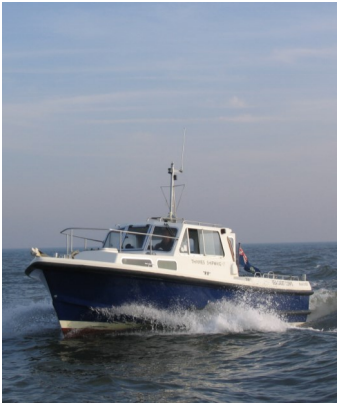
Sea Cadets on "Thames Shipwright"