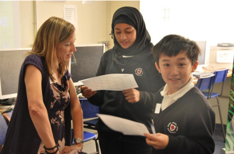
George Green School

In addition the Company awards an annual prize to the top student at each University.