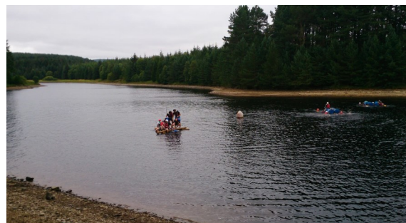
Staying afloat is more challenging!