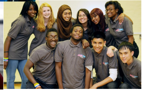
City Sea Exchange