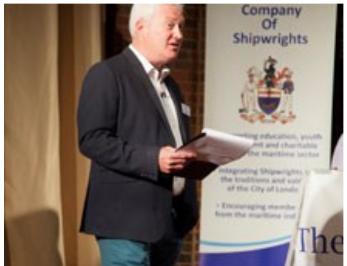
The Shipwrights Lecture 2015

junction with Southampton University have developed an annual lecture programme that brings together apprentices of naval architecture and marine engineering to hear from icons of the industry. The programme introduces apprentices to designers and builders in a lecture programme that they would not otherwise have the opportunity of meeting colleagues in their industry. The next lecture will be held in Southampton in October 2016—details on the website.