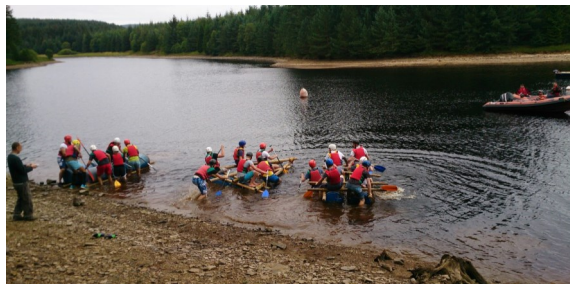
Fierce competition on Kielder Water

For many this is a daunting task but for all it is recognised as a milestone in their development and for some a life changing experience. And its fun! The Shipwrights commit some £30,000 a year for the programme and host 18 young apprentices, both male and female on the course from both traditional boatbuilding and the leisure industry.