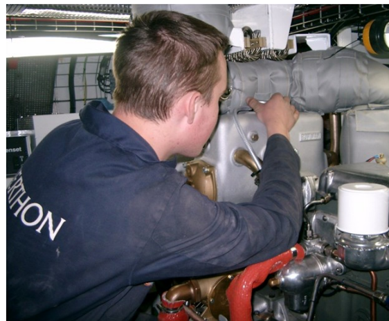
Engineering apprentice through Berthon

less important. The Head of Nautical Studies that the Shipwrights fund at the school was awarded a MBE in the New Year's Honours list for his contribution to Maritime Education and voluntary service to Maritime Safety. Our association with both schools goes to the heart of our ambition to encourage young people to consider a maritime career.